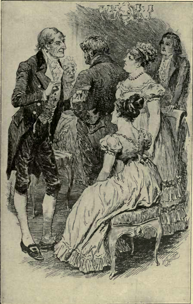
He listened patiently . . . to tales of the little woes of life in a country town